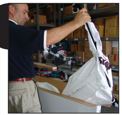
Remove ChopShop Saw Hood and aluminum poles from box.