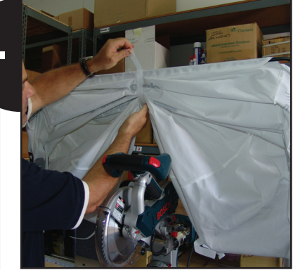
Unstrap the 3 Velcro hood wraps and let the saw hood fall into position.