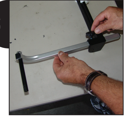
Insert the aluminum pole in the peacock tail and tighten knob.