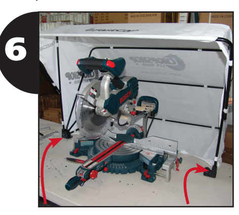
You can also mount the ChopShop Saw Hood to a table. Two mounting holes on each peacock tail will accept standard wood screws.