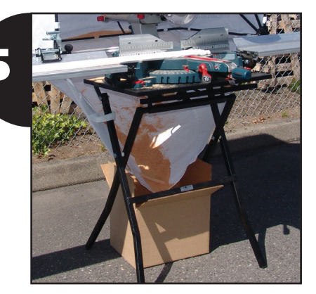
We recommend that you place a trash can or box under the ChopShop Saw Hood, which allows the dust and debris to collect in one spot.