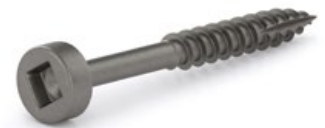
Dry lube finish

Most furniture screws are manufactured with a dry lube finish. The lubricant is wet when applied at the factory and is then heat dried. This provides a minimal corrosion resistance as a screw with nothing on it would rust very quickly and also makes the screws easier to drive as the dry lube reduces the driving torque required.